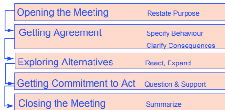
Foundation: Building a Relationship of Mutual Trust through Support and Self-Disclosure 08-11

Before the coaching meeting can be held, it is necessary to build a foundation of trust. The manner in which you conduct the meeting will directly affect the degree of trust and the future relationship with the employee.